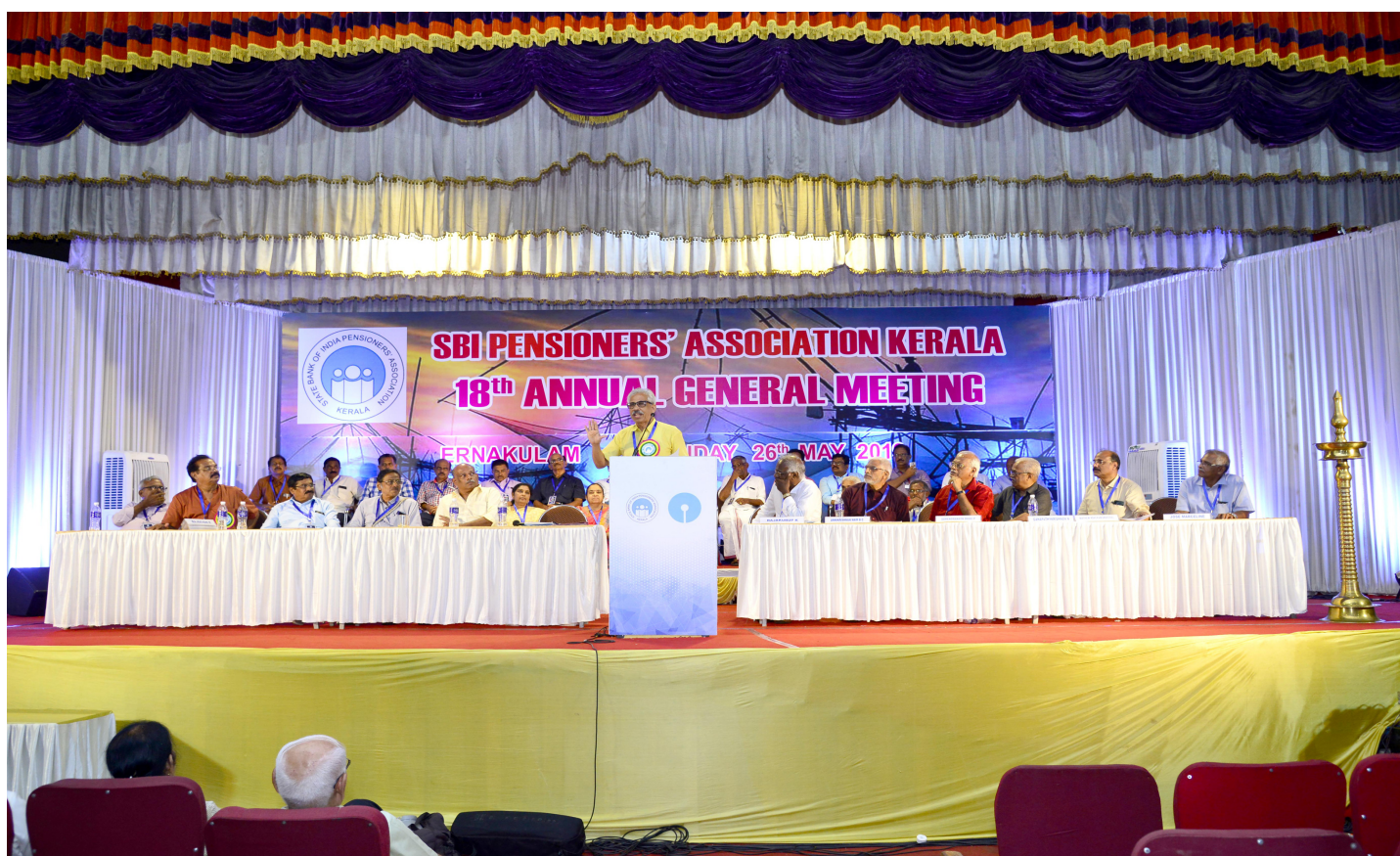
Photo Showing the presidium