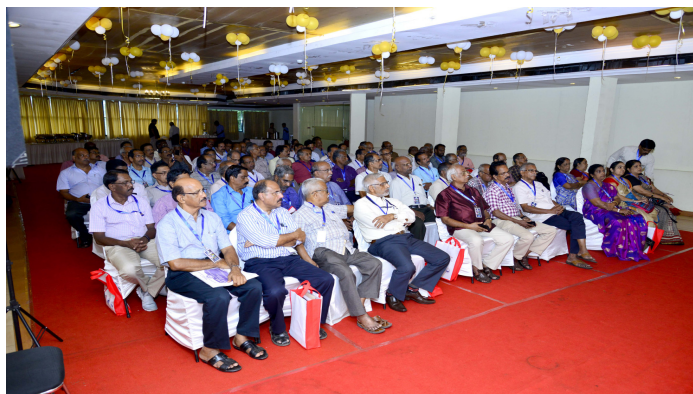
A view of the Delegates