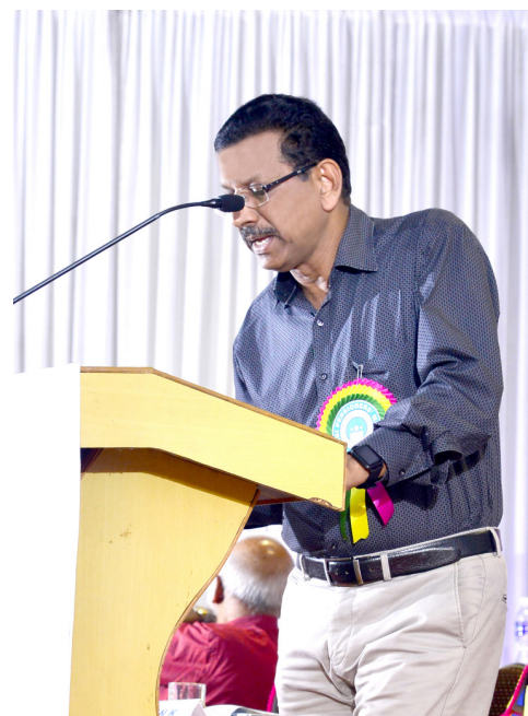
Shri V.Muraleedharan delivering felicitations