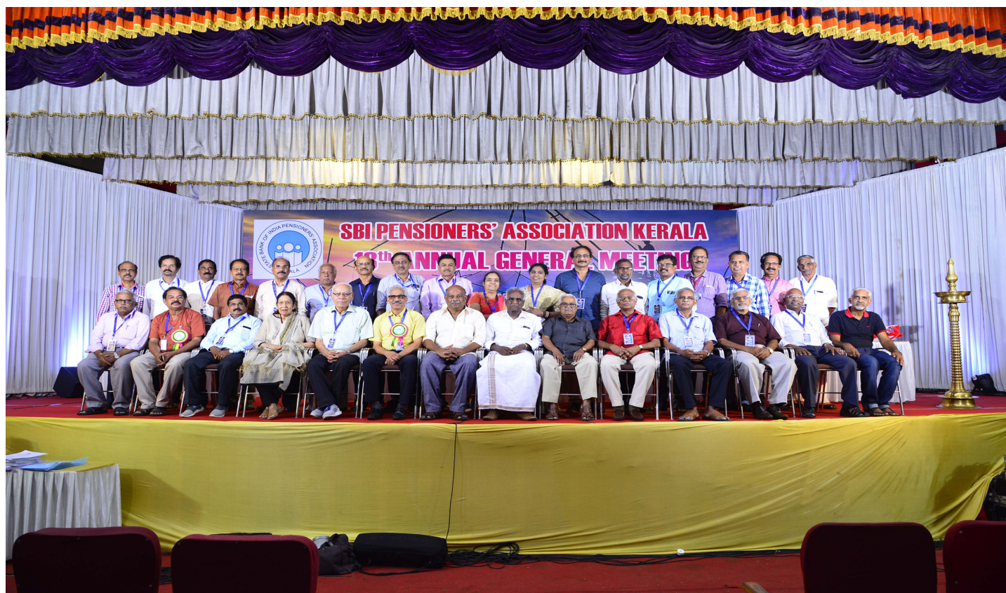
SBIPAK State Committee - 2019-2022