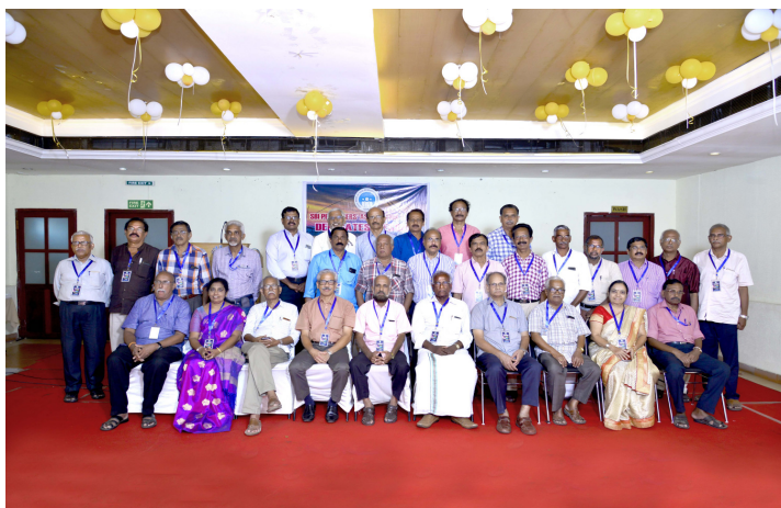
Outgoing Committee Members