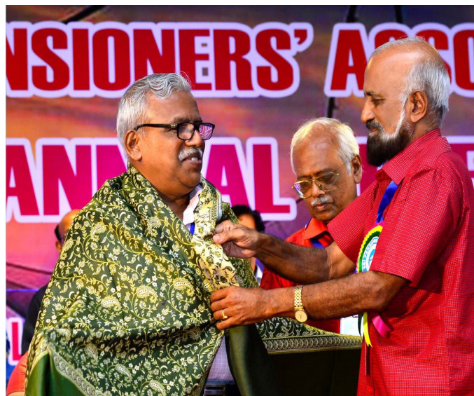
Shri Balachandran Nair MP being felicitated